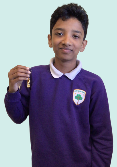
One of our term 3 winners with their golden boxing gloves

So, who has risen to the challenge? Turn the page to find out how the competition has unfolded over the last two terms!