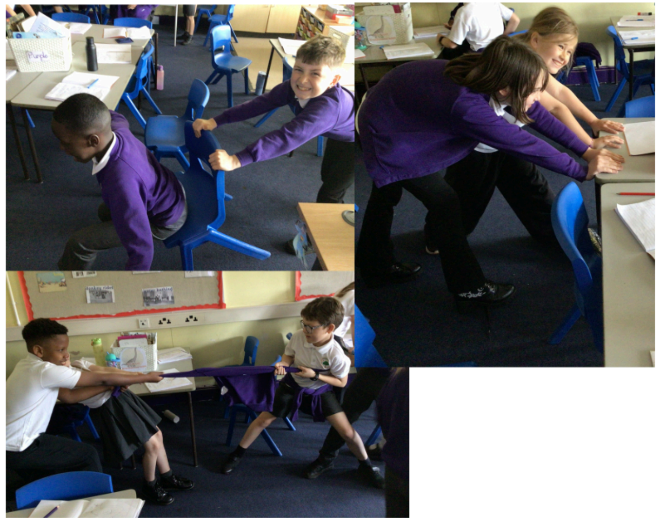
We looked for different ways we might use a push or pull force in everyday life.